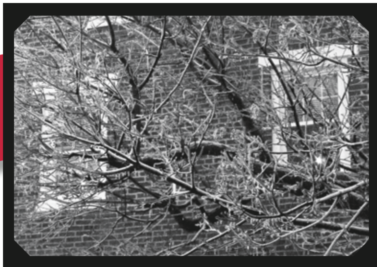
Brenda says, “This candle view is one of the more peaceful images of Christmas for me.”

♥ Must the manger be kept untouched by anything but