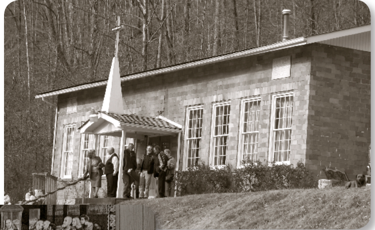
Little Buckhorn Mennonite Church Rowdy, Kentucky

One of the amazing things that blesses us is to see how God has, from the early days, called out young men who came to church as young boys and who now, as grown men with families, have been given very fruitful ministries. One who got his start in the first VBS in 1957 even before our church officially